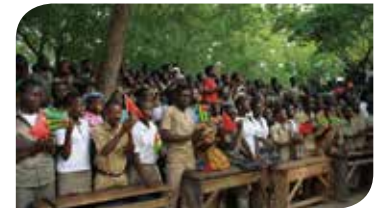
◇ In 2017, PT SDIC Papua Cement Indonesia conducted an education support activity themed "Work Together for a Bright Future," carrying out social responsibility practices at local schools.