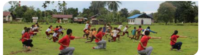
Students were practicing martial arts with teachers of an education support team