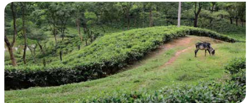
Tea plantation nearby Shahjalal Fertilizer Factory

◇ During the construction of Shahjalal Fertilizer Factory in Bangladesh, COMPLANT used advanced technologies and equipments in the world to meet local requirements for environment protection and energy-saving and pass performance tests smoothly. In the daily operation and production of the factory, COMPLANT conducts strict emission control measures to effectively protect the local environment. Local employees said proudly that the fertilizer factory is a factory free of dust, noise, odor, air pollution and water pollution. There is a large scale tea plantation near the fertilizer factory which has a history of about 150 years. The manager of the tea plantation said that the fertilizer factory had no negative impact on the planting of tea and the production and operation of the plantation.