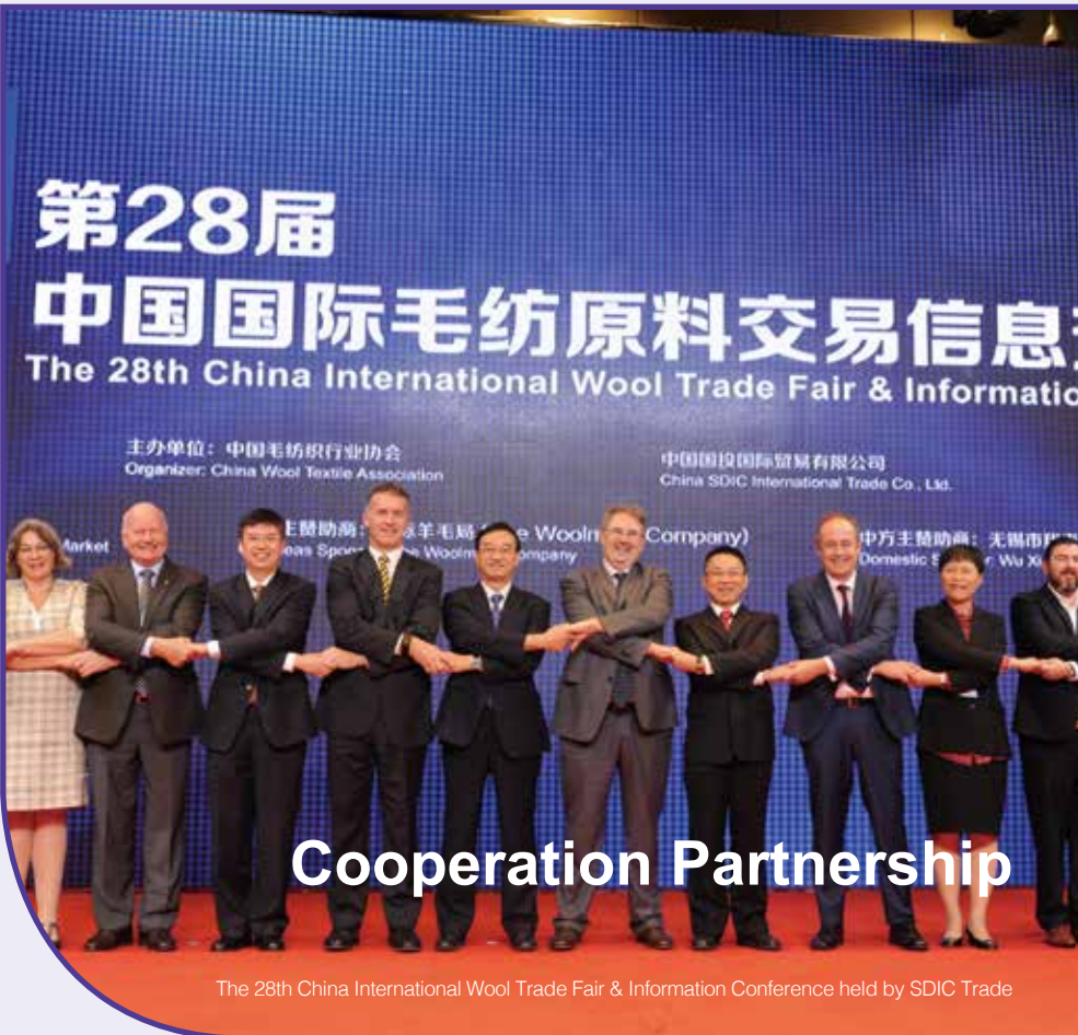
The 28th China International Wool Trade Fair & Information Conference held by SDIC Trade

SDIC has always abided by international conventions and business ethics, followed and learned the laws and regulations, as well as customs and habits of the countries and regions in which business is being conducted, insisted on compliance operation, prohibited commercial bribery and corruption, and reduced overseas operation risks. Adhering to the cooperation idea of “integrity and win-win results,” it has been committed to jointly establishing global strategic partnership and building a beautiful homeland with stakeholders both in China and abroad.