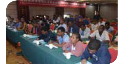
COMPLANT organized Ethiopian employees of OMO2 Sugar Factory Project to participate in business training in Nanning, capital of south China's Guangxi Zhuang Autonomous Region