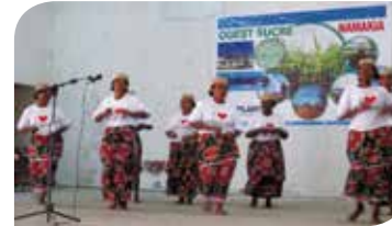
COMPLANT Namakia Sugar Complex Project Department organized an employee singing and dancing competition