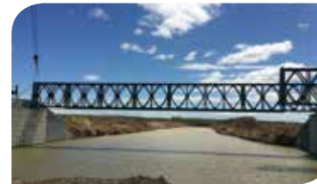
COMPLANT Ambilobe Sugar Complex donated 250,000 dollars to help repair the damaged Ambilobe Bridge, facilitating the travel of local people